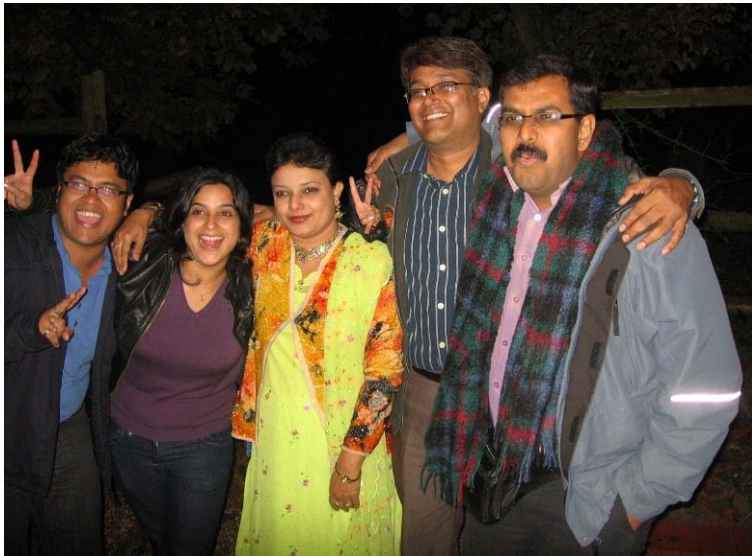
Last year's GSE Team from District 3250 enjoying an evening out during their visit

Please inform your relevant business and professional contacts about this fantastic opportunity for one of their employees to take part in a life-changing experience for four weeks next spring. Interview the candidate and if your club supports their application please forward the preliminary details below to :-